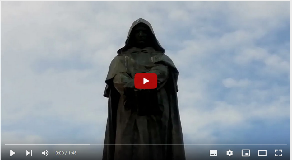
Video MFRR Italy Mission #3 https://youtu.be/RV_Hrzt6s