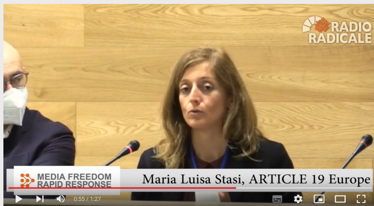
Video MFRR Italy Mission #4 https://youtu.be/tZ4FWsw7Qs4