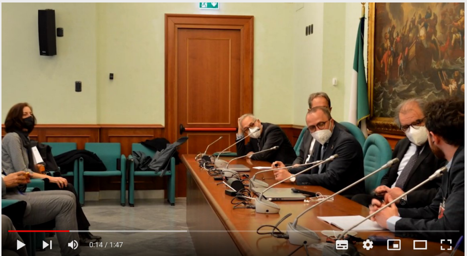
Video MFRR Italy Mission #6 https://youtu.be/O73GpQ9M8Cc